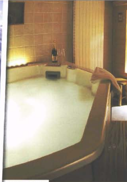
CHECK OUT THE HOT TUB