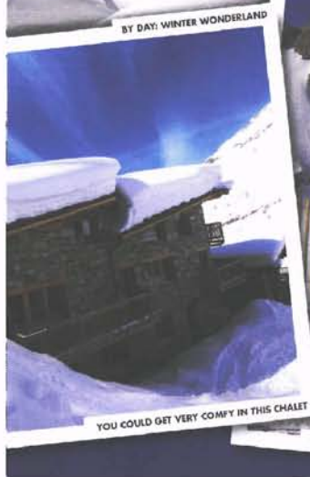
BY DAY: WINTER WONDERLAND